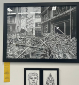
(Right) "Quiet After the Storm" by Rylee P, 3 rd Place in Young Creatives