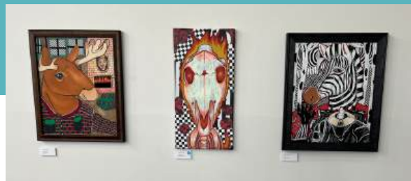
Pictured below are just a few pieces of art you can see in Samantha Gales' art show.