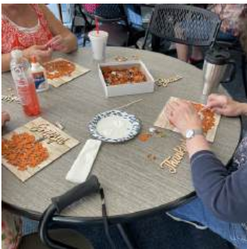
A photo from October's First Friday where they made a pumpkin craft out of puzzle pieces.

November will be a quieter month, but we still have fun things planned! Flip through our newsletter to see what's happening in November.